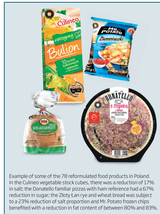
Example of some of the 78 reformulated food products in Poland. In the Culineo vegetable stock cubes, there was a reduction of 17% in salt; the Donatello familiar pizzas with ham reference had a 67% reduction in sugar; the Złoty Łan rye and wheat bread was subject to a 23% reduction of salt proportion and Mr. Potato frozen chips benefited with a reduction in fat content of between 80% and 83%.

In Colombia, two Aveia (Oats) prepared drinks' references were reformulated, in which the sugar level was reduced by more than 4 p.p., meaning around three tonnes were removed from the market, and the oats content increased more than 4 p.p., the equivalent of more than 30 tonnes.